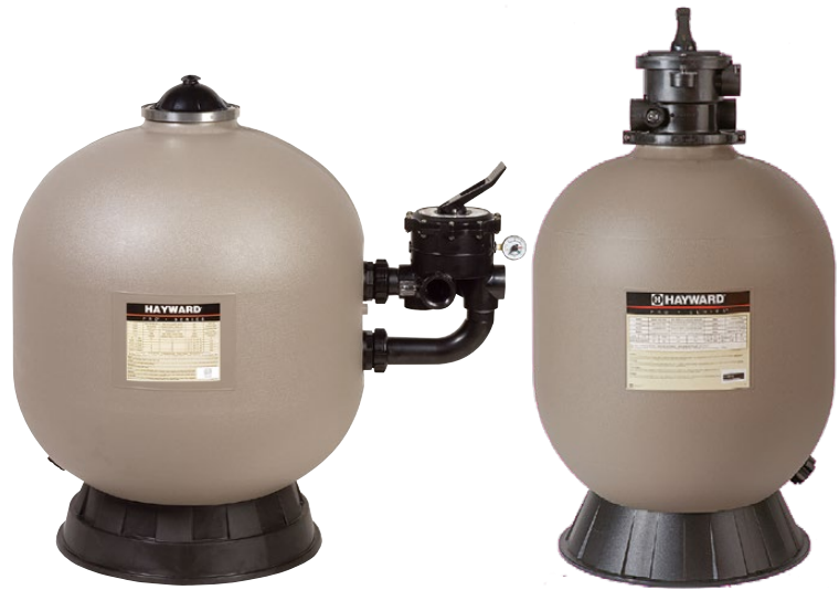
ProSeries™ HB Side