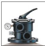
Sand easily accessible by removing the collar