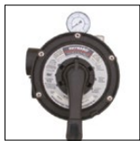
Vari-Flo™ 6-position valve