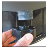
Drain with plug that also serves as a dismantling tool